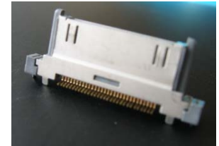
Physical USB Connections